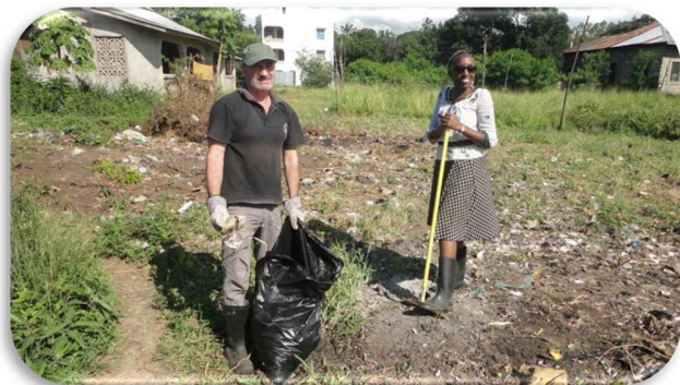
Doing our bit for the local community, our Director and Assistant Director, clearing away the rubbish dump which had “appeared” near the school.