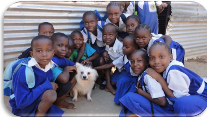
Every school needs a mascot