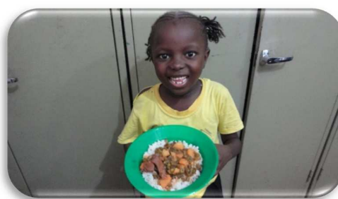
Food, glorious food