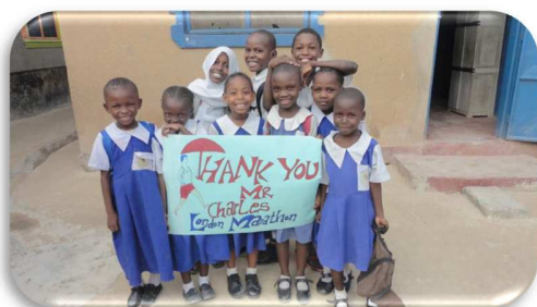
Thank you to all our supporters