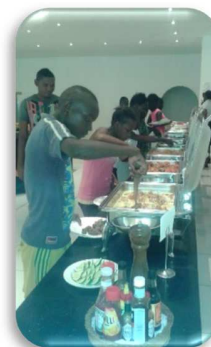
2014 Graduates enjoying their end of year trip